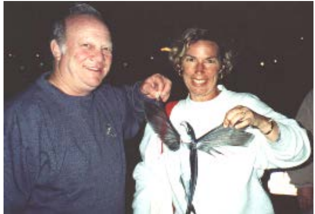
Fly fishing is fairly common, but fish flying is pretty rare, especially when one flies into a tour boat. However, it happened, as you can see from the picture.

Francie has some big travel plans for the next month or so. They include New York (twice) Cancun, and Chicago. More later!