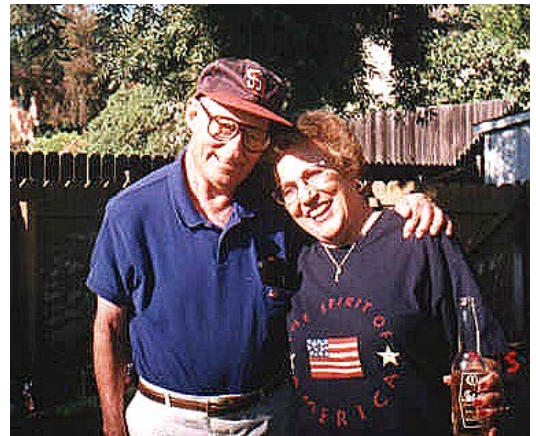
Grandpa and Grandma enjoying the party!

Here you can see Bruce expertly using for the first time the new grill. (The old one blew up!)